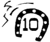
Our 10th Year