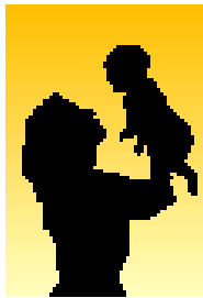
Our House...Es Su Casa